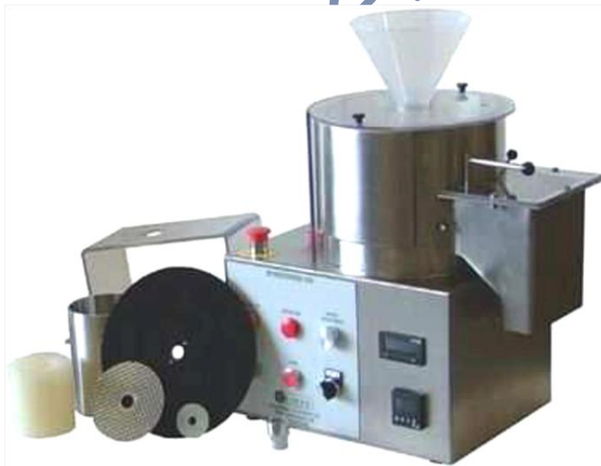
Figure 2: Extrusion Spheronizer

This technique involve in production of granules or pellets of uniform size with high drug loading capacity. It consist of multiple steps of wet mass extrusion followed by spheronization to produce uniform sized spherical particles with narrow size distribution.