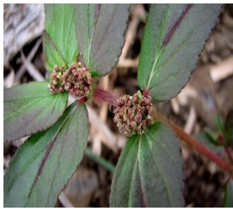
Fig: Euphorbia hirta L