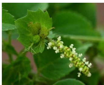
Fig : Acalypha indica L