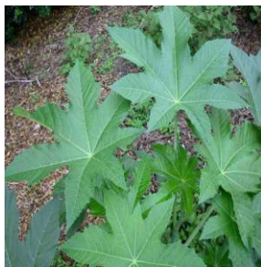
Fig: Ricinus communis L