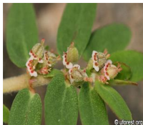
Fig : Euphorbia thymifolia L