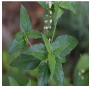
Fig: Croton bonplandianumbail