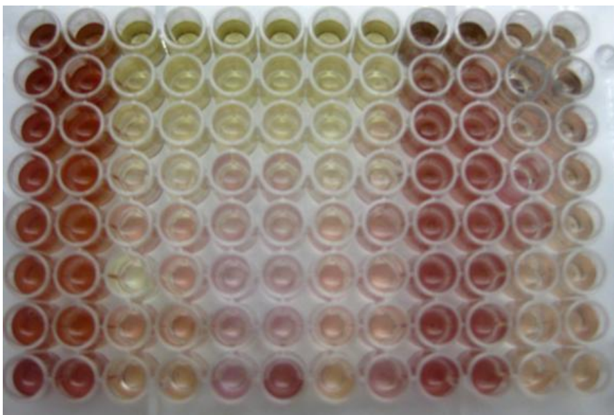
Figure 1: Antimicrobial activity, Micro dilution well plate after incubation