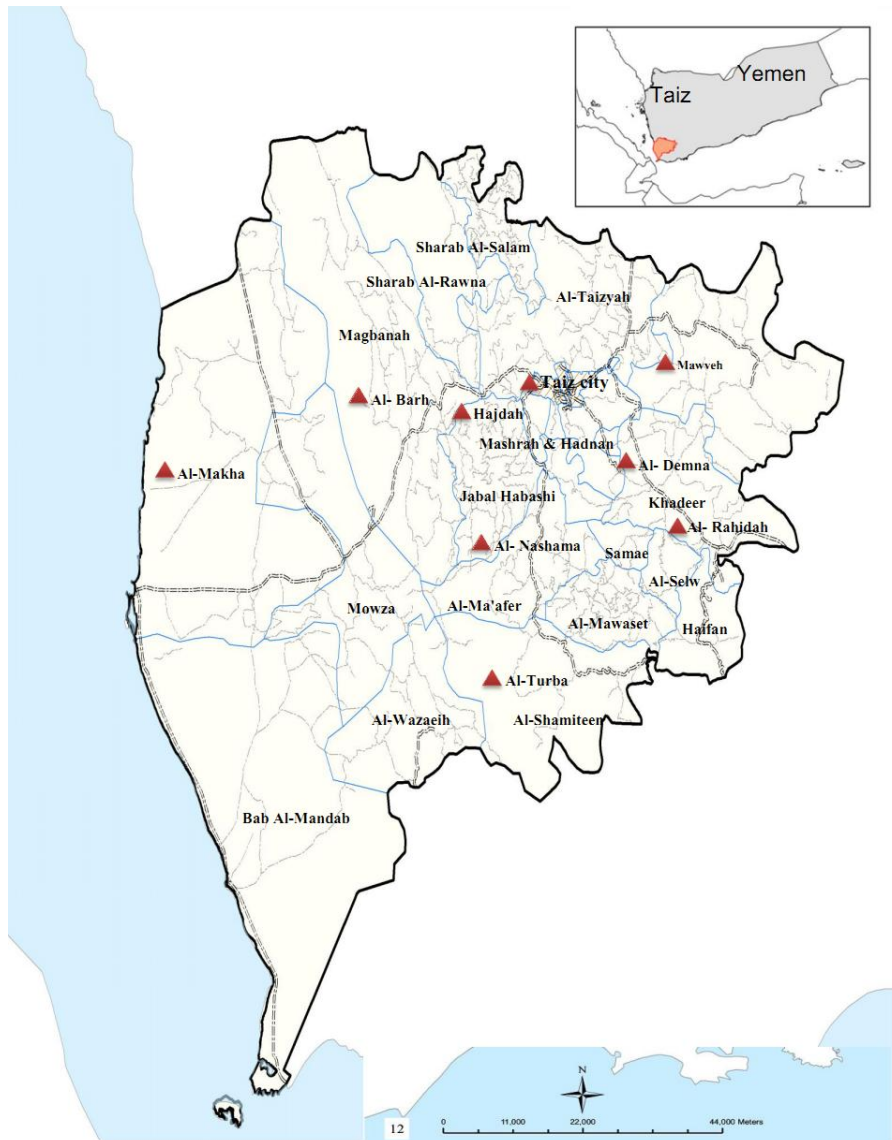
Figure 1: Map of Yemen and Taiz governorate

Five-mL blood sample was collected from 300 suspected patients suffering undifferentiated fever by venipuncture, transferred into a sterile anticoagulant-free sterile bottle, and allowed to clot. The clotted blood sample was centrifuged (3000 rpm, 5 min), and the serum (the supernatant) was put in separate Eppendorf tubes with a specific study number (SNO) transferred inside a cooling box and stored at -20°C until required for use.