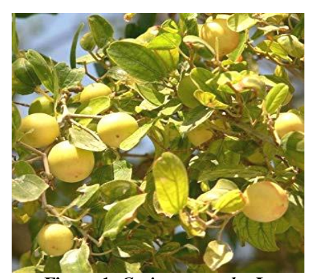
Figure 1: Carissa carandas L.

Flower colour: Red, yellow and pink Flowering season: March- November