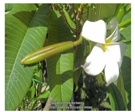
Figure 4: Plumeria alba L.: Leaves, flowers.

• The seeds are used in the treatment of dysentery.