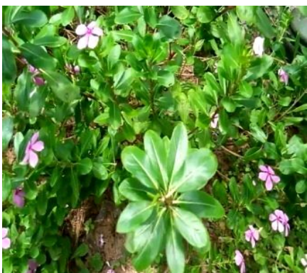
Figure 2: Catharanthus roseus (L).