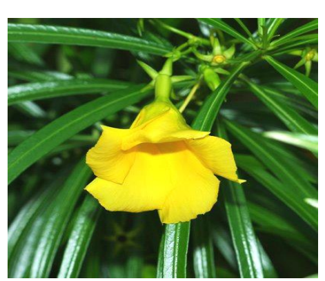
Figure 3: Nerium oleander Linn.

Flowering season: Flowering: January-July