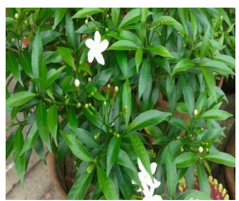
Figure 5: Tabernaemontana divaricata (L.)

Local Name: Tagar Family: Apocynaceae Status of occurrence: Rare