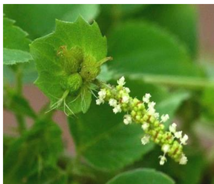
Figure 1: Acalypha indica L.