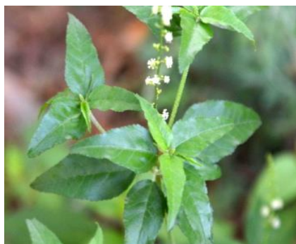
Figure 4: Croton bonplandianumbail