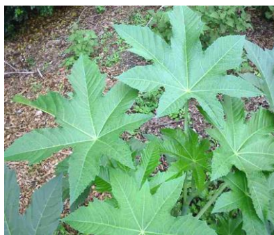
Figure 6: Ricinus communis L.