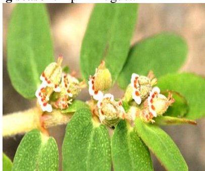
Figure 3: Euphorbia thymifolia L.