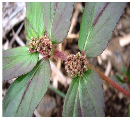
Figure 2: Euphorbia hirta L.