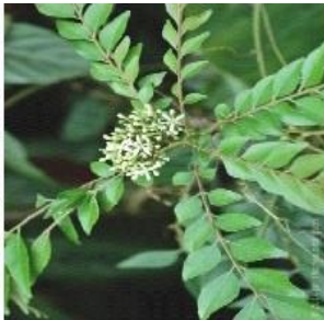
(a). Whole plant