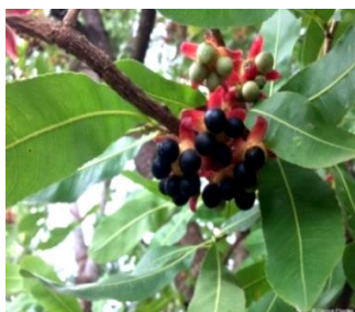
Figure 1: Leaf and fruits of O. Schweinfurthiana .

The fruits of O. schweinfurthiana are 1-5 oval appear between August and January, attached at the base are 2-4 black berries when ripe; they are enlarged, borne on brick-red persistent sepals turning cherry to brick-red. The bark is dark grey, thick, and deeply fissured into a grid-like pattern 10,11 .