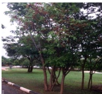
Figure 2: Whole plant of O. Schweinfurthiana .

The fruits of O. schweinfurthiana are 1-5 oval appear between August and January, attached at the base are 2-4 black berries when ripe; they are enlarged, borne on brick-red persistent sepals turning cherry to brick-red. The bark is dark grey, thick, and deeply fissured into a grid-like pattern 10,11 .