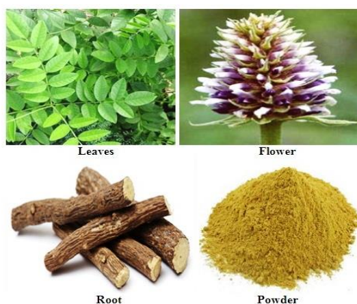
Figure 1: Leaves, flower, root and powder of Glycyrrhiza glabra .