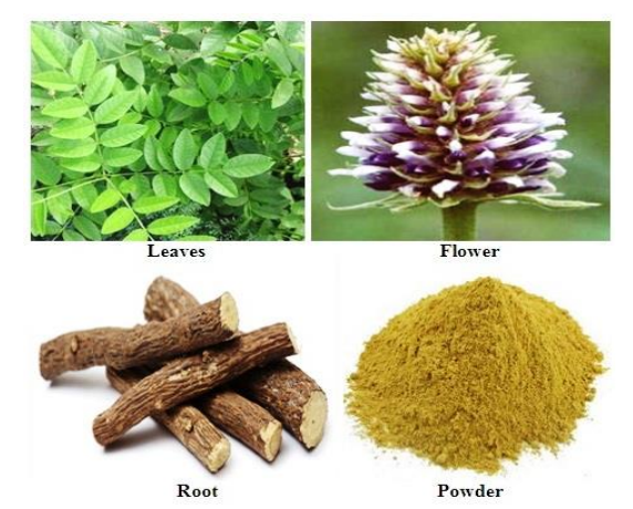
Figure 1: Leaves, flower, root and powder of Glycyrrhiza glabra .