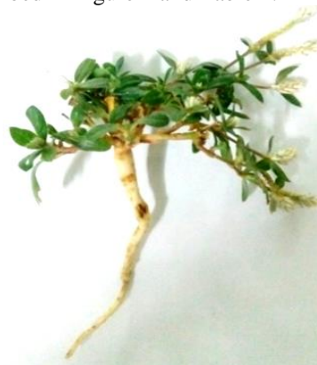
Figure 1: Organoleptic characteristics of the whole Plant of G. serrata .

The morphological characteristics of G. serrata root were described in Figure 1 and Table 1.