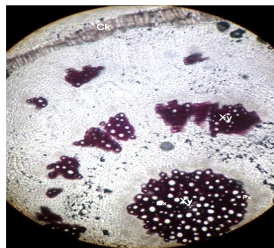
Figure 2: Transverse section of the root of G. serrata . Ck: Cork; Par: Parenchyma; Xy: Xylem; Ph: Phloem; Px: Proto Xylem and Mx: Meta Xylem.

medullary rays. Xylem tissue consists of spiral xylem vessels, xylem fibers and xylem parenchyma (Figure 2).